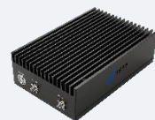
Available 220V System Benchtop Amplifier