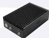
Available 220V System Benchtop Amplifier