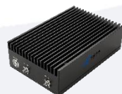
Available 220V System Benchtop Amplifier