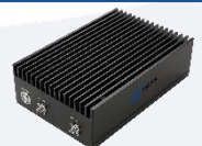
Available 220V System Benchtop Amplifier