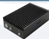
Available 220V System Benchtop Amplifier