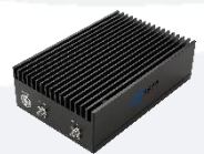
Available 220V System Benchtop Amplifier